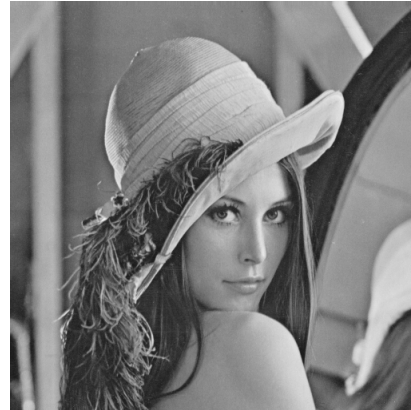
Fig. 2. 512 \times 512 Lena (8 bpp) watermarked in the pixel domain using permutation coding ( \xi_{emp} = 41.22 dB, \xi_{emp}^* = 46.88 dB, \rho_{emp} = 1.58 bpp, \epsilon_{emp} = 2.37 bits/pixel change, p = 72 , s = 3 ).