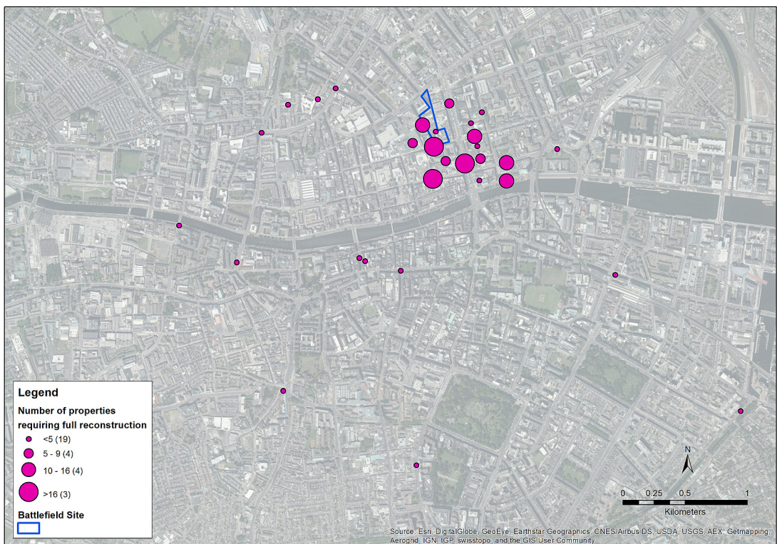
Figure 2: ‘Battlefield site’ contextualised with the areas of most significant military action (represented by buildings requiring full reconstruction after the Rising)

has raised apprehension not just for those concerned about its wider implications for planning law, but also for broader understandings of the impact of the 1916 Rising and other pre-1916 historic battles within the city. The designation is also questionable given the evidence of the spatiality of the 1916 Rising. Figure 2 compares the distribution of buildings requiring full reconstruction after the Rising (a proxy for the area which saw the most intense artillery fire by the British army as it quelled the Rising), with the court-designated 1916 Battlefield Site. There are clear discrepancies between the arena in which the most significant action took place and that which has been legally designated. While numbers 14-17 Moore Street are ‘authentic’, in that they have survived in their current form since 1916, there has been limited discussion of the extent to which most of the designated battlefield site has survived or subsequently been rebuilt.