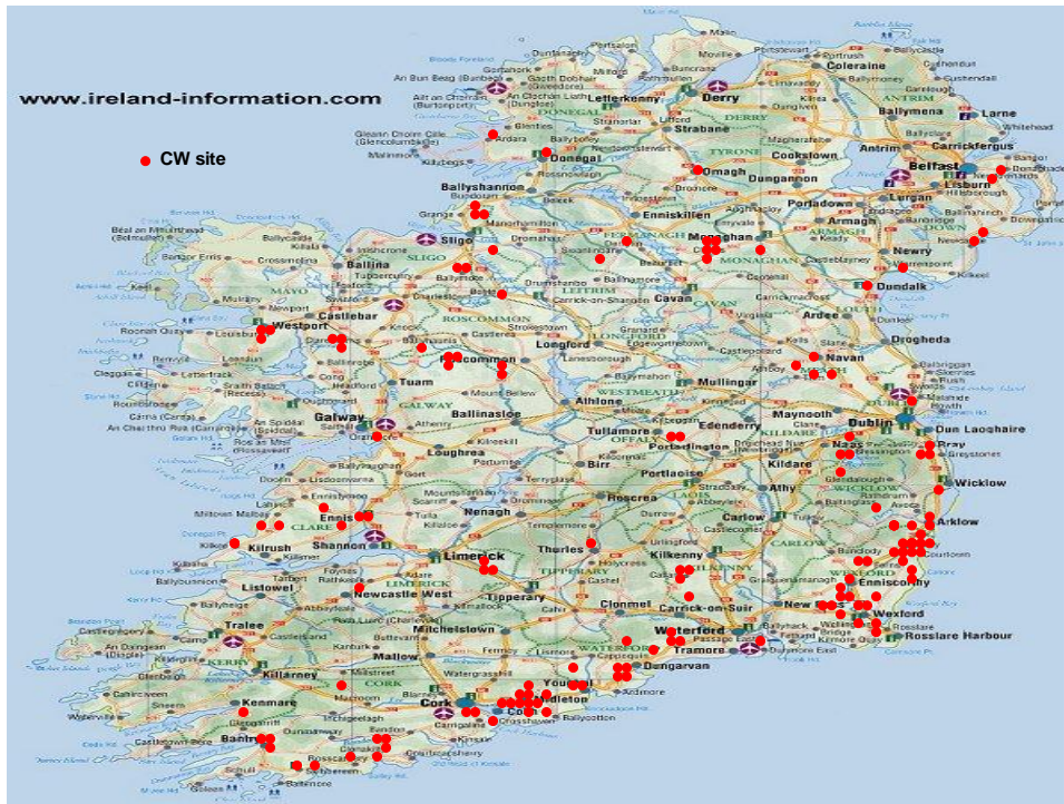
Fig. 1 Geographic distribution of CWs across Ireland