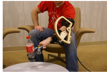
Figure 3. An able-bodied user grips a soda bottle by activating his biceps muscle and feels the grip reaction force as a reaction torque about the elbow.