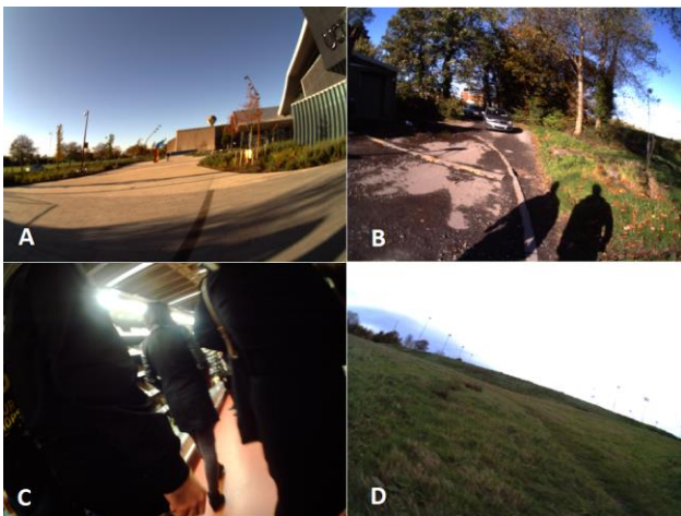
Figure 2. Examples of photographs from the wearable camera in four different walking conditions; A – normal walking, B – walking on a rough surface, C – walking in a busy area and D – walking up a hill.

Figure 2 shows examples of photographs from the wearable camera in four of the different walking conditions. The blind-folded walking condition is not shown.