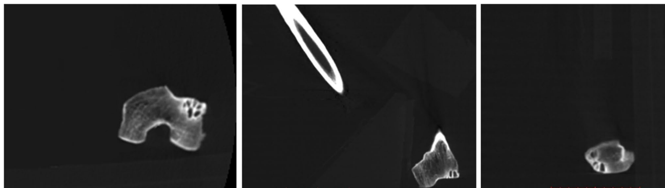
Fig. 4 Left: distal epiphysis of the right femur in axial view showing the lytic lesion on the lateral condyle. Center: lateral condyle lesion in coronal view. Right: lateral condyle lesion in sagittal view

addition, simple bone cysts do not often involve the epiphysis and the average age of affected patients is substantially younger (3–15 years old) than SU23-id49. NOF was easily ruled out, as it arises in the metaphysis of long bones in the lower extremities of skeletally immature individuals. Veritably, those lesions located in the epiphysis in skeletally mature individuals which were originally considered BFHs are now considered to represent bone GCTs, while those in the metaphysis are now agreed to represent NOFs. Malignant tumors were additionally excluded as the smooth edge and the sclerotic margin of the lesion favor a slowly growing benign disease process. Moreover, lytic