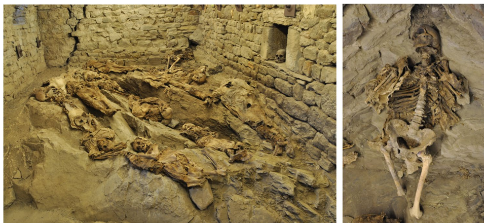
Fig. 1 Left: crypt of the Roccapelago church, which houses twelve of the best preserved mummies. Right: SU23-id49 as it now appears inside the museum