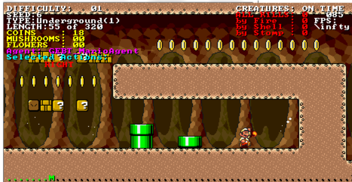
Figure 3: Level dead end. Mario has to come back and find another way.