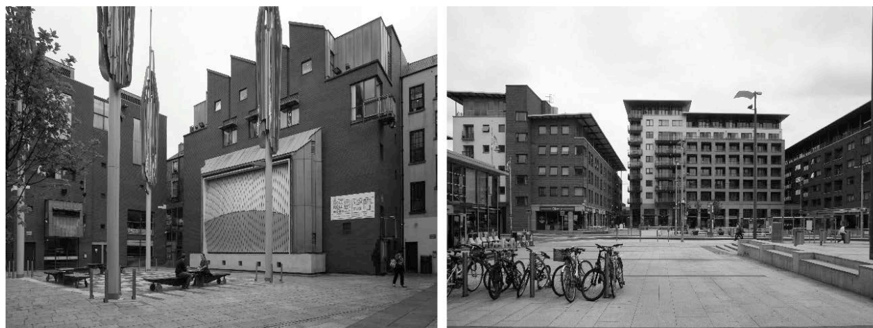
Figure 2 Left, Meeting House Square, Temple Bar; right, Mayor Square