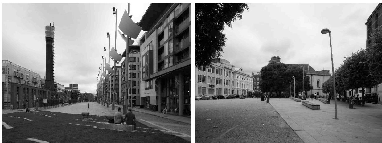
Figure 3 Left, Smithfield Square; right, Wolfe Tone Square