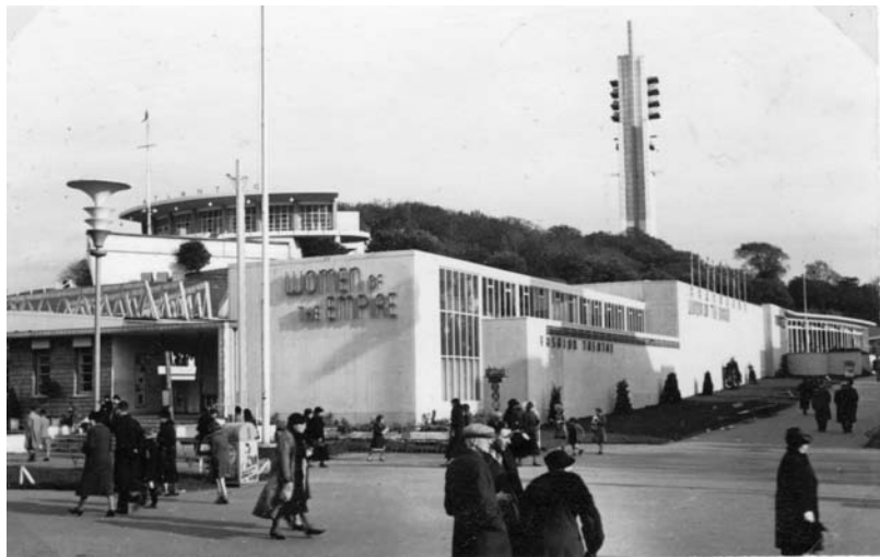
Figure 4 Margaret Brodie, Women of the Empire Pavilion, Empire Exhibition, Glasgow, 1938.

a refreshing and restful note in Glasgow life; they reacted upon the tastes of the people, and they became popular not only with citizens but with visitors from far and near.