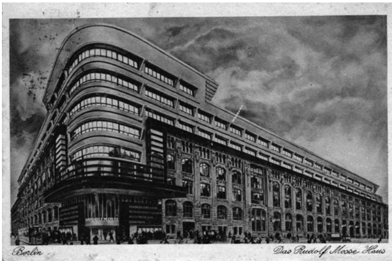
Figure 3 Erich Mendelsohn, Richard Neutra, and Paul Rudolf Henning, Mossehaus, Berlin, 1923 (postcard, http://www.postalesinventadas.com/2010/11/berlin-das-rudolph-mosse-haus-querido.html ).

advantageous, as the book sold very well. Consequently, Mendelsohn wrote two further books for Lachmann-Mosse's publishing company, including a monograph on his architecture that appeared in 1930. 8