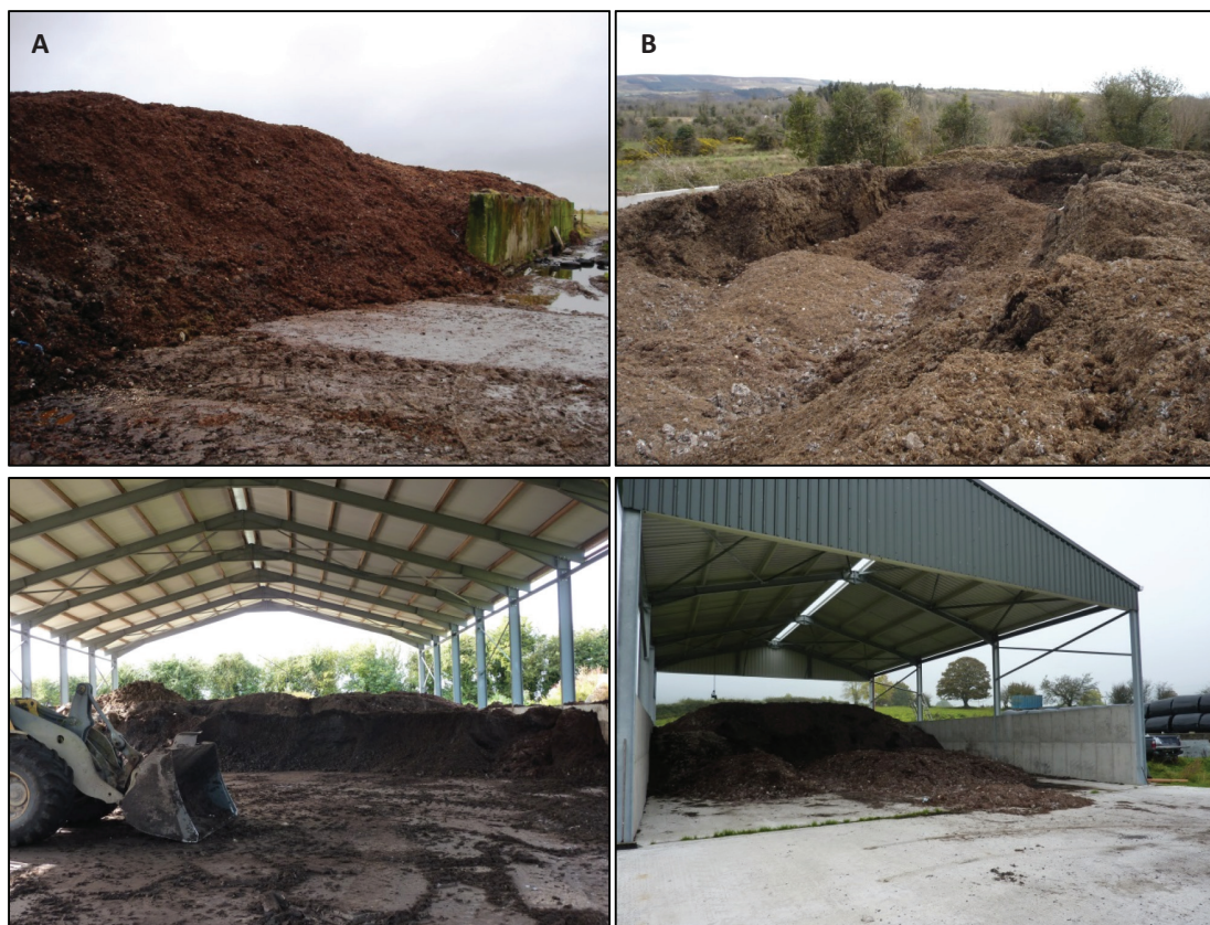
Figure 1. SMS storage sites: Outdoor uncovered sites: (A) site 1; (B) site 2; covered sites: (C) site 3 and (D) site 4.

exposure could be obtained by wearing a full face mask for respiratory protection (EN 136:1998 CL 1) fitted with a H 2 S filter (code EN 141 A1B1E1K1), available from suppliers of health and safety equipment, and these were used on all subsequent visits. Disposable Tyvek (Uvex Arbeitsschutz GMBH, Fürth, Germany) suits and QRAE+/QRAE II H 2 S monitors (Rae Systems, San Jose, USA) (supplied and serviced by Seridan Safety, Dublin, Ireland, www.seridan.com ) were worn by research personnel during all operations.