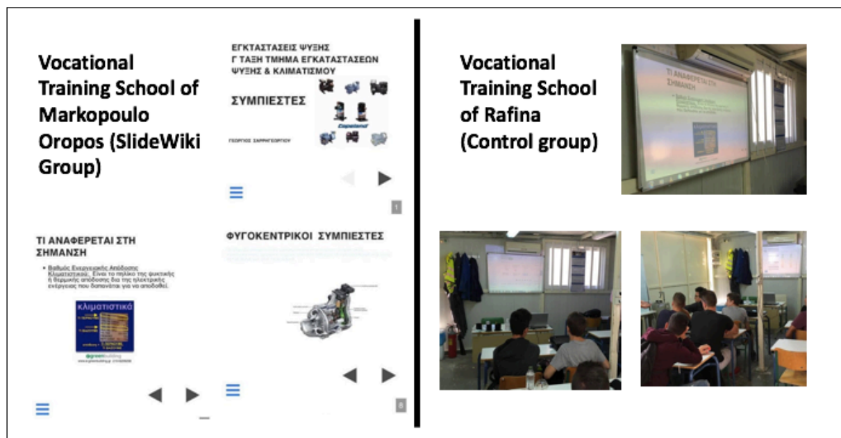
Figure 4. Course content in SlideWiki and photos from the control group of the University College Dublin pilot.

A total of 23 students have been involved in this pilot (11 in the control group and 12 in the SlideWiki group). Screenshots of SlideWiki slides and photos taken during this pilot are shown in Figure 4. The methodology followed in this pilot is the development of concepts within the area of energy labels. The students are encouraged to look for and find content through the theoretical presentation from the educator, structure their thoughts and practice the theory through the hands-on activity session in the class. Feedback and revision are the final and equally important parts of the lecture in order to revise and self-reflect on the learning scenario and the teaching strategy.