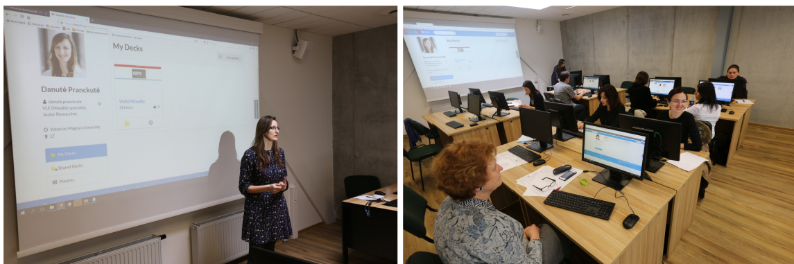
Figure 2. The introductory workshop for teachers organized by Vytautas Magnus University.

The main objectives of this pilot are to promote the usage of OERs and Creative Commons (CC) licensing in the teaching process among Vytautas Magnus University teachers, as well as involve students in the learning process, familiarise them with SlideWiki and encourage further usage of the platform. 15 teachers are participating in this pilot, selected from different faculties and different programmes, both undergraduate and postgraduate ones. All selected teachers have good computer literacy skills and are experienced in the use of the institutional Moodle Learning Management System (LMS) and its tools. Their teaching subjects vary between foreign languages, management, political and social sciences.