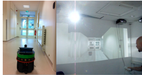
Figure 3. Physical Robot & NeXuS in CAVE experiment, left: robot in the office space, right: user in the CAVE

Reality technology while the user can use natural forms of interaction to manage the remote robot.