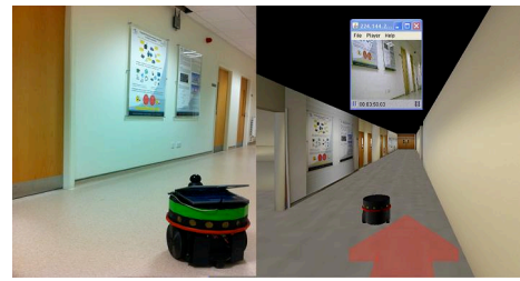
Figure 2. Physical Robot & NeXuS on Desktop experiment, left: robot in the office space, right: NeXuS snapshot

The IHRI project addresses the questions of effective HRI by aiming to remove the dependency on traditional GUIs. In contrast, the user and the robots share the same space through Mixed