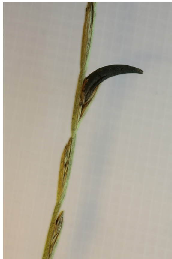
Figure 2 Externally visible parasitic fungus Claviceps purpurea on the plant/seed.

ergovaline is approximately 1,000 times more potent and 5 times more efficacious in causing vasoconstriction than lysergic acid [26,27]. Similarly, C. purpurea produces many ergopeptides, the most prominent toxins amongst them being ergotamine, ergocristine, ergosine, ergocryptine and ergocornine [22,24].