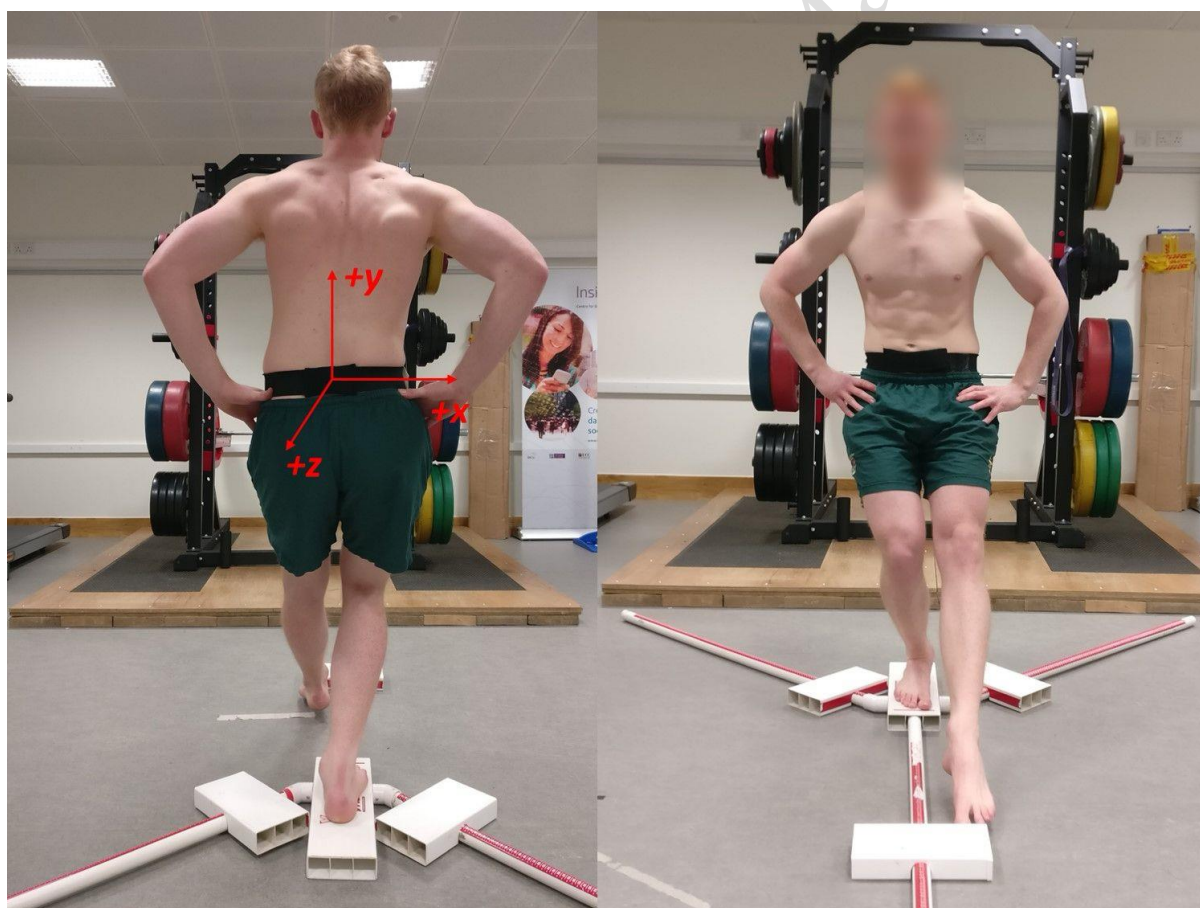
153 154 Figure 2: The sensor mounting location and orientation of the inertial sensor axis during the 155 anterior reach of the YBT.

143 offline using MATLAB (2014, Mathworks, Natwick, USA). The Shimmer3 inertial sensor is a 144 commercially available product (costing approximately €250) which can be paired via Bluetooth to an 145 Android tablet for data acquisition using Multishimmer Sync (Shimmer, Dublin, Ireland) or custom 146 developed software. Such inertial sensor technology provides a means to capture detailed 147 biomechanical data without the need for expensive laboratory constrained motion capture systems. The 148 development of custom made software applications has the potential to allow for the instant automated 149 online processing of this data, removing the need for the time consuming and expertise intensive offline 150 processing required with laboratory based systems. As such, this technology provides an inexpensive 151 and accessible means to objectively quantify dynamic balance performance in an unconstrained 152 environment, addressing many of the limitations of laboratory based systems 13 .