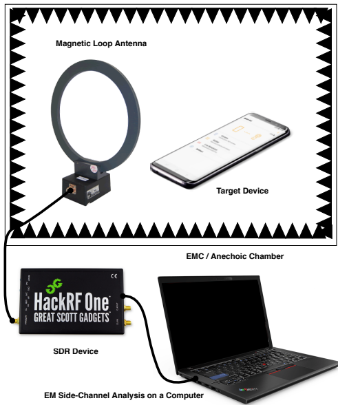
Figure 3: An illustration of how an EM side-channel analysis would be performed in a forensic investigative setting. Target device is placed inside an EMC/Anechoic chamber and observed using an SDR device that is connected to an EM analysis software framework.

already starting to be realised and others are ambitious predictions that can prove significantly beneficial.