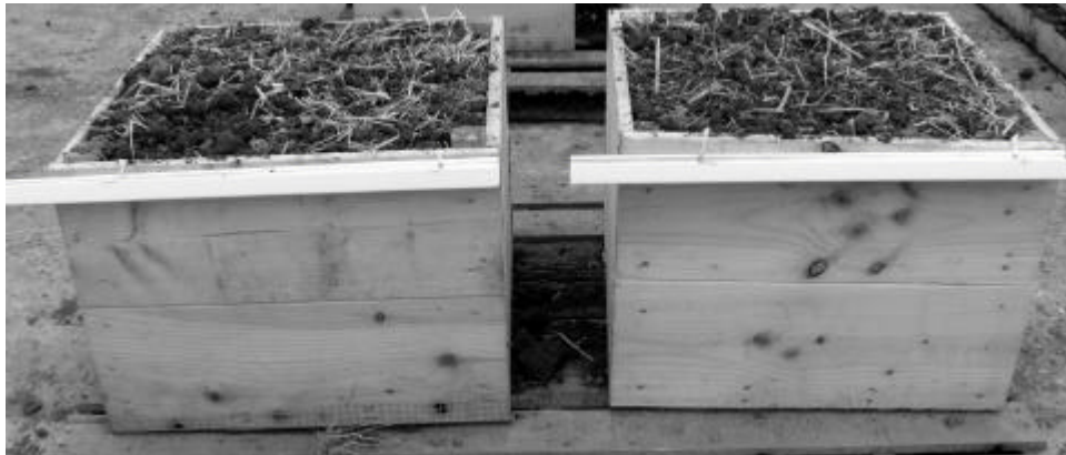
Fig. 1: Soil boxes used to determine the influence of measurement methodology on the recorded infiltration rate of a medium clay-loam soil

Measurement of infiltration rate: The infiltration rate of soil was determined once a week for a period of eight weeks using each of three methods; each method was replicated three times