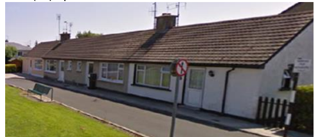
Fig 1 College View, Wexford town, County Wexford, Ireland – pre Retrofit

Following the upgrade, the dwellings all are designed to operate in the BER category of A, with the majority having a BER of A2 (25 to 50 kWh/m 2 /a). The primary heating system is an electric Heat Pump (HP), and one of the dwellings (nZEB 27) also uses a Solid Fuel (SF) open fire with back boiler.