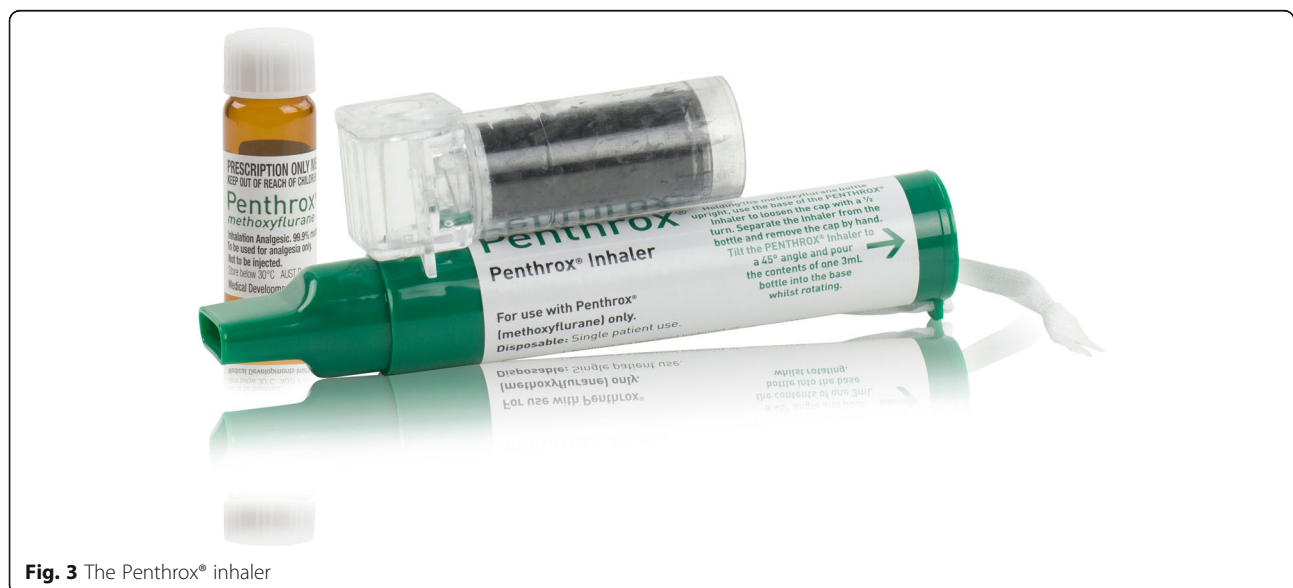
Fig. 3 The Pentrox® inhaler

If successfully randomised, the research nurse assists the participant to self-administer 10 successive inhalations of the IMP. Participants and parents/legal guardians are advised that rescue analgesia is available immediately on request at any time. Permitted rescue medications are intranasal fentanyl, intranasal diamorphine, intranasal ketamine, intravenous morphine, oral morphine or Entonox (50% nitrous oxide and 50% oxygen mixture), dependent on the standard practice of the participating site and at the discretion of the treating clinician. This approach is in line with current recommended practice [10] for the management of moderate to severe pain. Standard-of-care oral analgesic medications (paracetamol