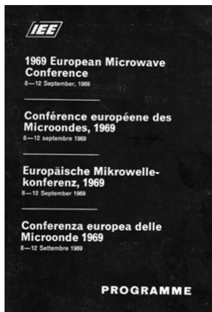
Fig. 1. Advance Programme of the first EuMC, London 1969.