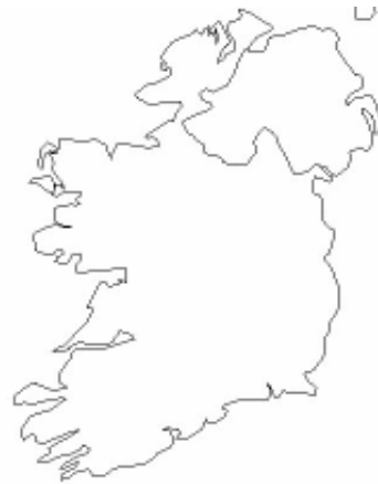
Figure 1: Ireland as state, Ireland as island

Yet at the same time, at all levels of southern Irish society, notions of territorial reunification have been consciously and more importantly unconsciously recycled. It is this unconscious recycling that is interesting. The hegemonic map-image used in the 26-county state serves to elide the political partition of the island. Map-image “A” in figure 2 is the map-image of the Ireland the state; it is hardly ever used and it jars the sensibilities of even the most ardent 26-county nationalists. This contrasts with the practice of Scottish, Welsh even Northern Irish nationalists of symbolising their “homeland” as disembodied from the territory of adjacent political entities.