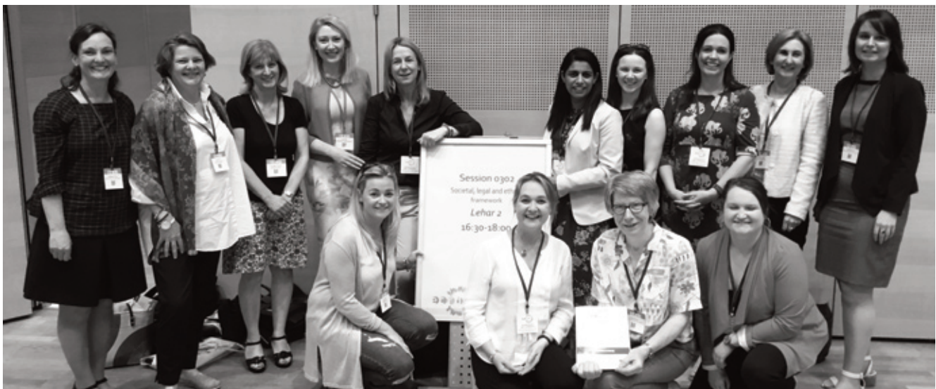
Photo: Most of the Irish contingent at the European Conference for Rare Disease, Vienna 2018. The group includes many rare disease research advocates, including representatives from the Rare Disease Office, Cystinosis Ireland, Rare Diseases Ireland, Retina International, 22q11 Ireland, RAinDRoP, Fighting Blindness, HRCI, PTC Therapeutics, the National Clinical Programme for Rare Diseases, DEBRA Ireland, Friedreich's Ataxia Research Alliance Ireland and Muscular Dystrophy Ireland.

As we look to the future, more will be required to create formal and resourced rare disease research networks in Ireland and to facilitate our increased involvement in international networks. It is also important that we focus on research as a critical part of the solution for improved rare disease care, rather than treating it as a separate and less urgent endeavour.