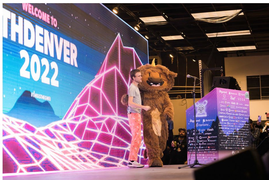
Figure 1.2: "This is the man that has all your money!".

While admiring the Cypherpunks’ anarchist ideologies and creations, Ethereum’s politics have been gently redirected to emphasize a culture of software development, immersed in cultural diversity and belonging, and epitomized in memes and motifs of rainbows and unicorns, as demonstrated in Figure 1.2, which shows co-founder of the Ethereum blockchain, Vitalik Buterin, wearing pyjama pants and hugging a person in a “Spork” suit at a cryptocurrency software developer conference. By taking a more subtle but still political path to societal change, “Ethereum is not in the business of countering the state” directly (Ennis, 2021 ). This has allowed for the gradual advancement in the development of decentralized infrastructure for financial markets, governance, government, identity, and coordination between digital and physical assets into the mainstream. Relatively little reprimand from regulators to stop this burgeoning industry has occurred along the way, despite some SEC notices being served and US Treasury Sanctions against virtual currency mixer “Tornado Cash.”