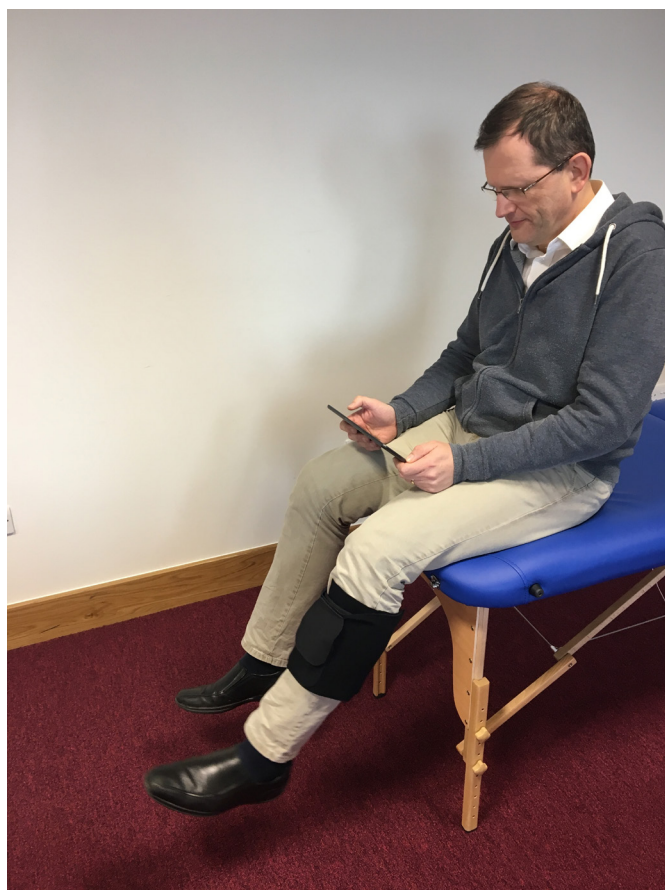
Figure 1 User setup of biofeedback system with single inertial measurement unit placed on the shin and associated tablet application (written consent provided for use of image).