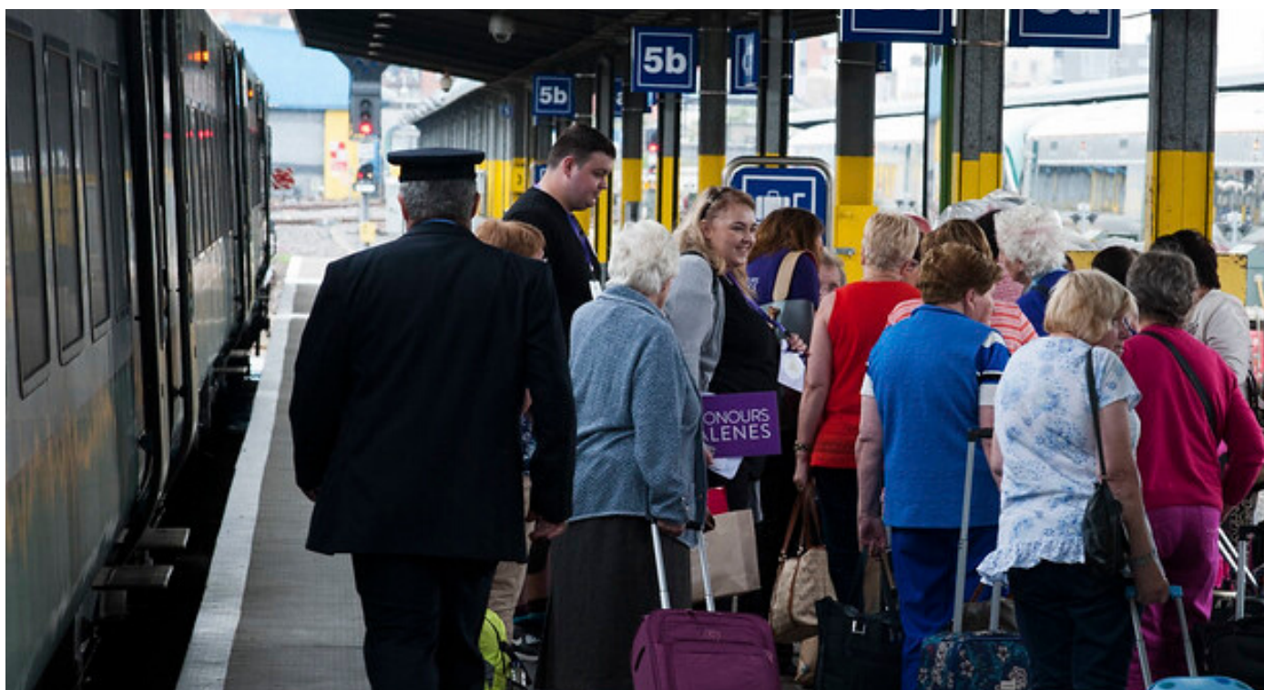
A group of women arriving at Heuston Station on June 5th.