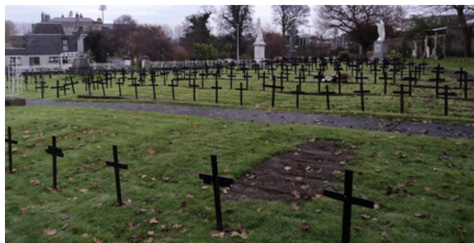
Some of the Magdalene graves at Donnybrook.

There's graveyards at Donnybrook...And it just gets forgotten. Nothing on it. There are ladies getting forgotten...No one goes up to see them anymore or anything.