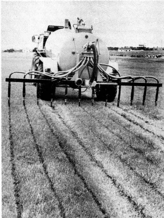
The bandspreeder minimises drifting of slurry spray

This consisted of disinfecting slurry with 2 different products, (a) lime milk and (b) hydrated lime and applying it to grass plots, harvesting the plots for silage approximately 7 weeks later, measuring grass yield, ensiling the grass and analysing silage quality.