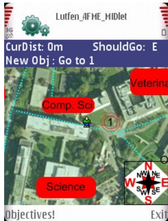
Figure 2. The Player is notified that they have a new objective.

Lutfen provides a basic but robust implementation of the exergaming paradigm. While constrained in practice to a mobile phone, there is significant opportunity for enhancing the game from a number of perspectives. Firstly, the game should be personalized to the requirements of the players. A one-size-fits-all approach does not exploit the full potential