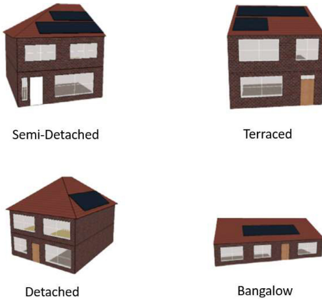
Fig. 2. The geometric model of Irish residential building archetypes for energy parametric simulation for Dublin City [1].

Furthermore, weather data for Dublin is obtained from the standard EnergyPlus dataset, featuring historical records and projected weather patterns for 2030, provided by Meteonom. This information is crucial for evaluating the influence of climate conditions on the effectiveness of building retrofitting strategies under different climate change scenarios.