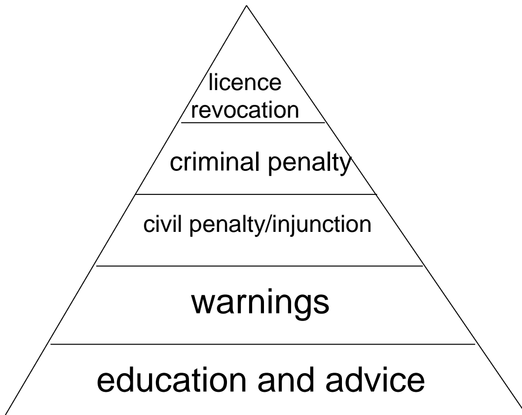
Figure 2 Example of an Enforcement Pyramid Adapted from Ayres and Braithwaite 1992

The responsive approach to regulatory enforcement is conceived of differently from a paradigm of criminal law enforcement in which we might expect all offences investigated and with sufficient evidence to result in a charge being laid. Even with 'real crimes' the idea of non-discretionary and automatic enforcement is contested (Sarat and Clarke 2008). The selective approach to enforcement, oriented towards the instrumental objectives of an enforcement agency, may even be at odds with common understandings of the rule of law as requiring universal application of law to all (Freigang 2002).