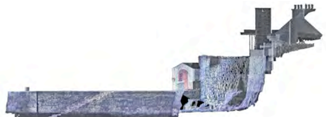
Fig. 1. Coliemore Harbour point cloud section (Spratt-Murphy, 2015)

Initial scoping of potential harbours was undertaken with reference to the UAU "Ports, Piers and Harbours" in concert with a review of historic and contemporary Ordnance Survey maps to identify suitably sized and historically relevant harbours for the pilot study. Coliemore Harbour, south of Dublin, was selected for the pilot because of the complex relationship of natural rock outcroppings to the incremental and irregular cut stone constructions that form the harbour. Preliminary LiDAR scans were undertaken of the harbour which, after considerable manipulation of the point cloud data, produced very credible sectional representations (Fig. 1).