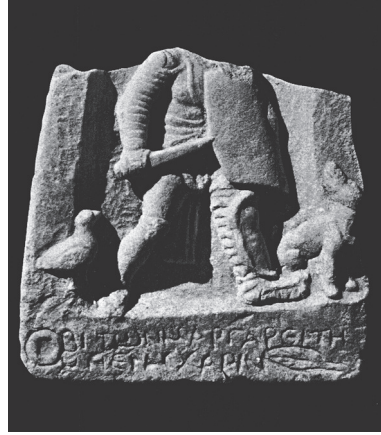
Fig. 1 : Gladiatorial grave stele from Hierapytna (originally published in Papadakis 1998: 81, fig. 515)

Somewhat surprisingly, it is the Cretan city of Hierapytna which yields a particularly well-executed funerary stèle depicting gladiatorial imagery (figure 1). Funerary memorials illustrating gladiators operated within the confines of Roman convention and, as such, conveyed information relevant to the social position occupied by those commemorated. Chaniotis has observed that the epitaphs of Roman Crete apply the standard funer-