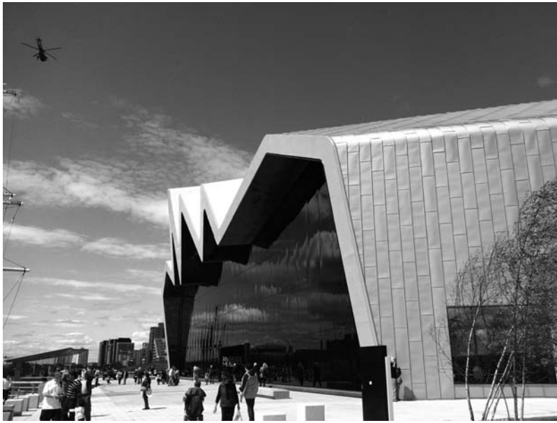
Figure 7 Zaha Hadid, Riverside Museum of Transport, Glasgow, 2011 (photo, https://upload.wikimedia.org/wikipedia/commons/5/56/Riverside_museum_from_front.jpeg ).

teaching at the Glasgow School of Architecture, where, according to her obituary, she was “forceful, demanding but kindly,” with a “pawky sense of humor and highly refined sense of irony.” 39 An exceptional mention in the Herald occurred when a journalist on holiday in Jersey in 1951 happened to overhear a conversation in a hotel lobby: “‘Yes,’ continued the elderly gentleman with the cultured voice. ‘It was an open competition; of course, the designs were displayed anonymously, and when the winner was announced to be a dame from Glasgow you could have heard a pin drop. Brodie was the name. Nice young woman.’” 40 The project in question was a war memorial and art block for Jersey’s Victoria College, a prestigious secondary school for boys. It was completed in 1952.