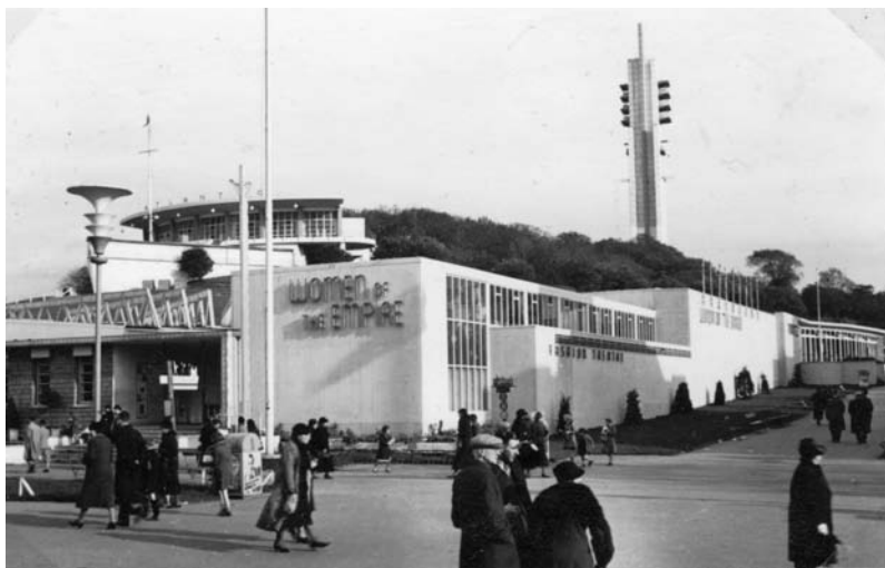
Figure 4 Margaret Brodie, Women of the Empire Pavilion, Empire Exhibition, Glasgow, 1938.

a refreshing and restful note in Glasgow life; they reacted upon the tastes of the people, and they became popular not only with citizens but with visitors from far and near.