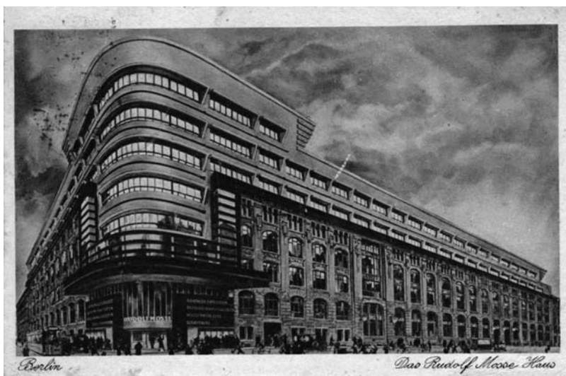
Figure 3 Erich Mendelsohn, Richard Neutra, and Paul Rudolf Henning, Mossehaus, Berlin, 1923 (postcard, http://www.postalesinventadas.com/2010/11/berlin-das-rudolph-mosse-haus-querido.html ).