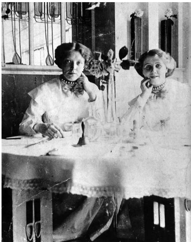
Figure 1 Waitresses at the Room de Luxe, Willow Tea Rooms, Glasgow, ca. 1905.

We all are indebted to Beatriz Colomina for her description of modern architecture as mass media. 5 With the exception of her own fascinating study of Playboy , however, most of the subsequent scholarship inspired by this thesis has focused on how architects communicate with each other, above all through professional journals and exhibitions. 6 Of course, the audience for these outlets has always included critics and historians (one has only to think of Nikolaus Pevsner's role at the Architectural Review ). 7 Still, we can accurately describe that audience as a specialist one, rather than a general one.