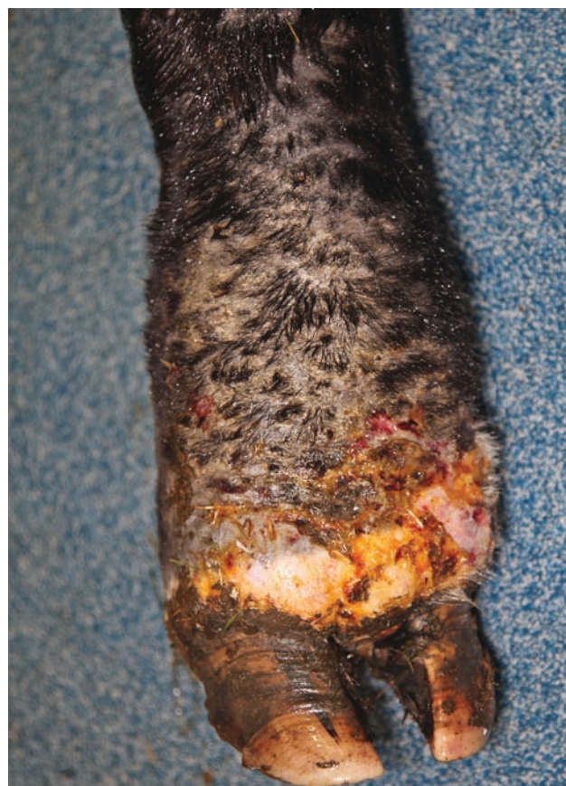
FIG 1: A cranial view of extensive, firm, diffuse, soft tissue swelling extending to the coronary band of animal A

Histopathological examination of the cutaneous lesions revealed multiple pyogranulomatous foci within the dermis and subcutis