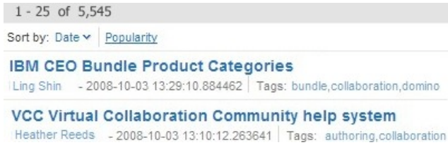
Figure 1. The first two results for the tag ‘collaboration’.

For example, in Figure 1, a filter query has been performed for the tag ‘collaboration’, which matches 5,545 bookmarks (only the top two results are shown). For each bookmark displayed, “hooks” for pivot browsing are provided. The query could be further refined by clicking the username ‘Ling Shin’, resulting in all bookmarks that ‘Ling Shin’ has created with the tag ‘collaboration’ being displayed. The pivot browsing style of interface makes query refinement simple; however, it requires multiple steps to reduce result lists to a manageable size.